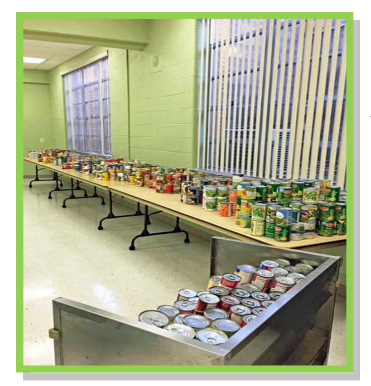
Tables of food sorted after the collection (1 of 2)