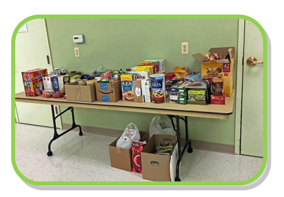
2 of 2

December Food Closet Item of the Month: Canned Vegetables